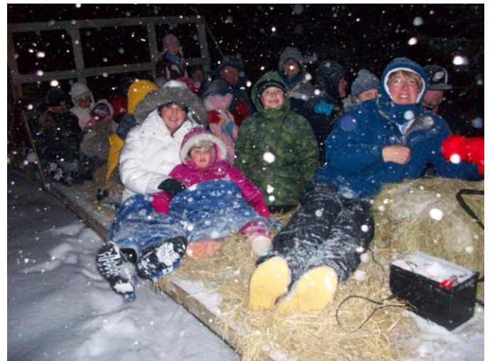
Trinity families enjoying a sleigh ride at Cavanaugh's.

A memorable evening was celebrated with over 50 of us attending the Cavanaugh Carriage Event on Friday night. The meal was in a cozy shed warmed with a wood burning stove, beautiful antiques, and good company. We met some of the farm animals and ate supper together. Thanks to everyone who made the tasty food! The snow gently fell as we took the bobsled ride. We were pulled by 2 friendly mares, complete with bells. Some of us enjoyed visiting and eating marshmallows around the bonfire. Time spent with friends and family is always well spent! Thanks to everyone who planned the event.