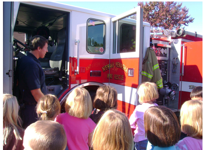
First and Second grade learning about fire safety and fire trucks.