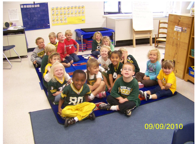
Preschoolers enjoying their new rug!

Save the date! Muffins for Moms will be November 3 rd starting at 8am. Come enjoy some muffins in the Large Fellowship Hall with your child, then stay for chapel. For moms who can not make it – dads or other special people may substitute in.